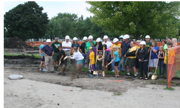
Pool Groundbreaking Ceremony